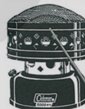
Model 511A700 Discontinued (9-71)